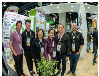
2024 POST-SHOW REPORT