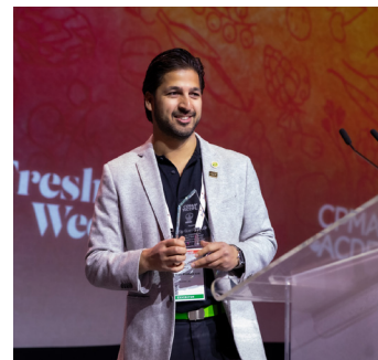
City Wide Produce